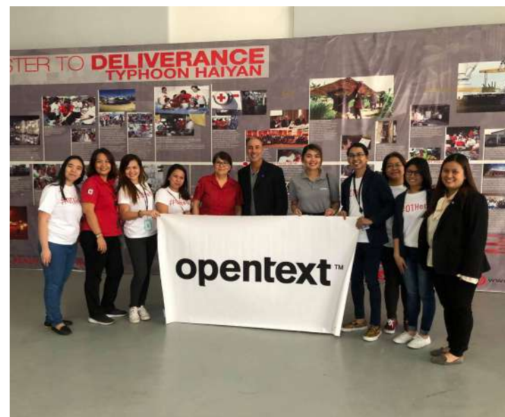
Team OpenText in Philippines supporting the Red Cross Taal Volcano Relief efforts

An outline of our corporate giving eligibility criteria can be found online here.