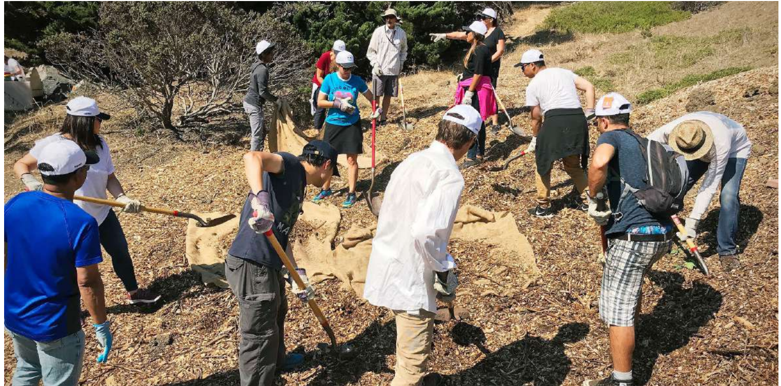
Team OpenText in San Mateo tree planting and doing a beach clean-up.

Sao Paulo, Brazil —We made a donation to FUMCAD, the Municipal Fund for Children and Adolescents. Our team visits group homes, nursing homes and orphanages to spend time with residents and donate food and clothing.