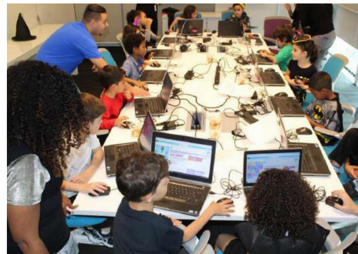
OpenText offices around the world celebrate Hour of Code with families.

To inspire young women to pursue careers in STEM (science, technology, engineering and mathematics) fields, OpenText sponsored the Northeast Collegiate Cyber Defense Competition (NECCDC) in March 2019. Our offices around the world also hosted Hour of Code events, which teach coding basics through fun and interactive computer games designed to stimulate early interest in STEM fields. Last year, we reached more than 400 children through events at our Gaithersburg (U.S.), Waterloo (Canada), Grasbrunn (Germany), Reading (U.K.), São Paulo (Brazil), and Hyderabad (India) offices.