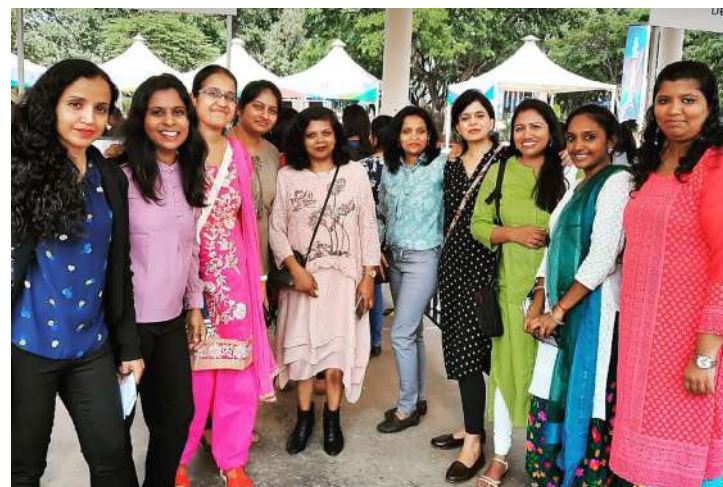
2019 OpenText Grace Hopper Delegation India

We also recognize the importance of increasing female representation in the technology industry, and created the Women in Technology (WIT) program to advance gender equality. Each year, we send delegates to the Grace Hopper Celebration, the world's largest gathering of women in technology. The women we send are trailblazers at OpenText, inspiring and emerging leaders who will drive change in our company and beyond.