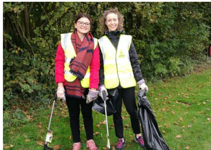
OpenText employees recognize and celebrate Earth Day annually.

Employee education and engagement —Employees are encouraged to take action on their own to help protect the environment. For example, during Earth Week, they are challenged to do one thing for the environment and post and share achievements on our internal social network. This year we celebrated Earth Day by encouraging at-home and online activities to support social distancing and still recognize the challenges of climate change.